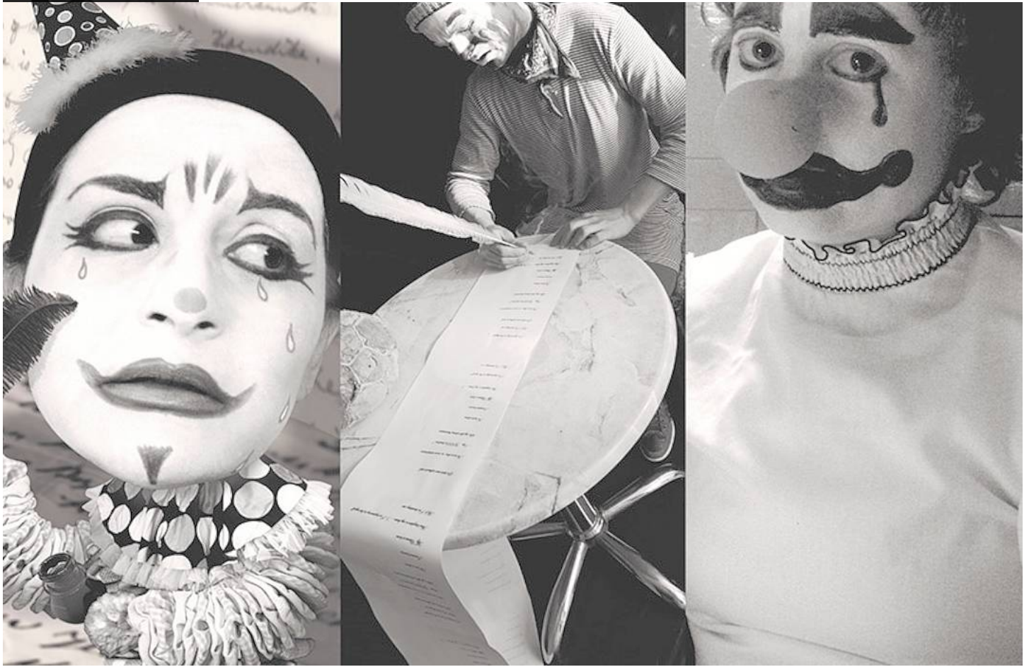
LOVESICK CLOWN- Humberto. Artists from around the world offered to fill photo requests for men in isolation, even requests for “photos” of imaginary subjects. Some photo requests were filled more than once, giving the men in Tamms multiple versions of their desired image. Chicago animator Lisa Barcy, Dutch photographer Harry Bos and Baltimore filmmaker Stephanie Barber each orchestrated a version of Humberto’s detailed request for a lovesick clown: “A lovesick clown: holding a old fashioned feathered pen: as if writing a letter: from the waist up: in black and white. As close up as possible: as much detail as possible: & the face about 4 inches big.” From left to right: photos by Lisa Barcy, Harry Bos and Stephanie Barber, 2012.